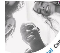
2nd International Convention

“We need a proactive rather than a reactive approach to mitigate challenges and adjustment difficulties faced by Care Leavers. Implementation is the key.”